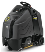
B 95 RS Bp Pack