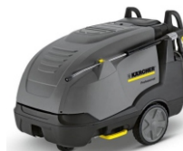
HDS 8/16-4 kW-4 E (12 / 24 / 36 kW)