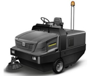
KM 150/500 Classic