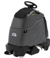
CV 60/2 RS