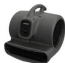
AB 30 Classic