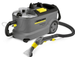
Puzzi 10/1 *Eu