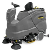
B 150 R Bp