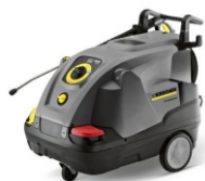
HDS 6/14 C