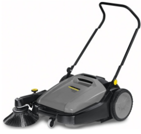
KM 70/15 C