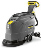
BD 43/40 Classic EP