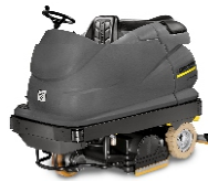
B 250 R Bp