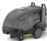
HDS 10/20-4 M Eco