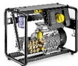
HD 7/16 - 4 Cage Classic