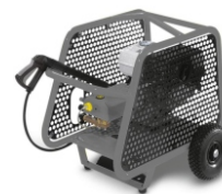
HD 1050 B