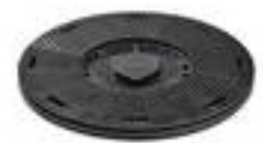
Universal Pad Holder