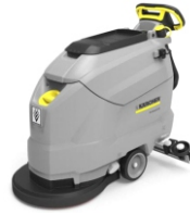
BD 50/50 Classic