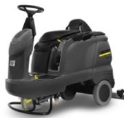
B 90 R Bp