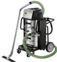
IVC 60/30 Ap