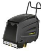
BR 47/35 Esc