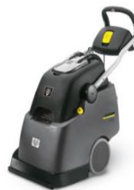
BRC 45/45 C Ep