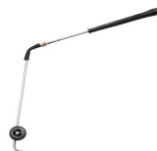
Under Body Lance