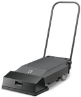
BR 45/10 Esc