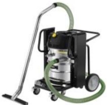
IVC 60/24 - 2Ap