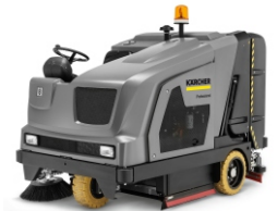
B 300 RI