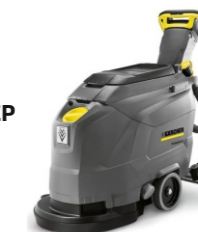
BD 43/40 C EP