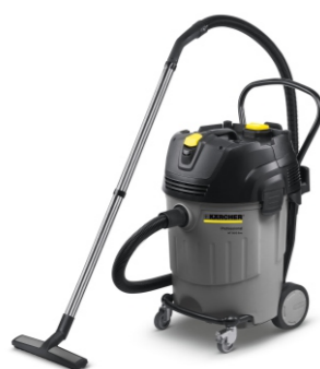
NT 65/2 AP