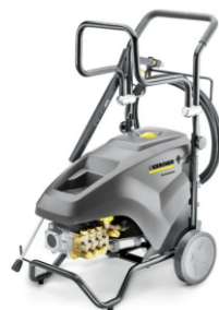
HD 6/15 KAP