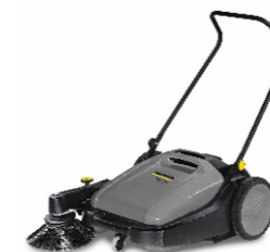
KM 70/20 C