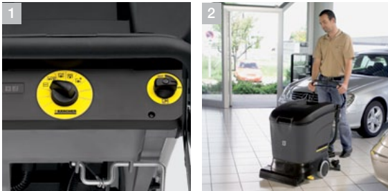
BD 40/25 C Bp