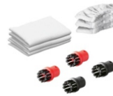
Multipurpose accessory kit (2.863-215.0)