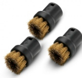
Round brush with brass bristles (2.863-061.0)