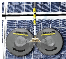
iSolar 800 Solar Panel Cleaning