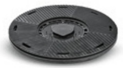
Universal Pad Holder