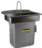
PC 100 M2 BIO