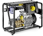
HD 7/16 - 4 Cage Classic