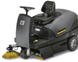
KM 100/100 R P