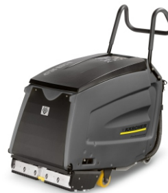
BR 47/35 Esc