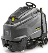
B 95 RS D 65 R