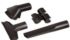
Vacuum Tool Kit

^ Machine with cartridge filter # Machine with pleated flat filter