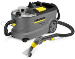
Puzzi 10/1 *Eu