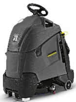
BD 50/40 RS Bp