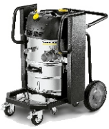
IVC 60/24 - 2 Ap