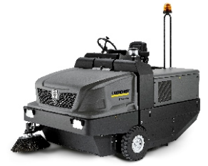
KM 150/500 Classic