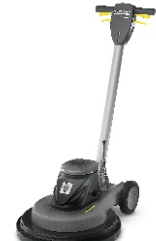
BDP 50/1500 C