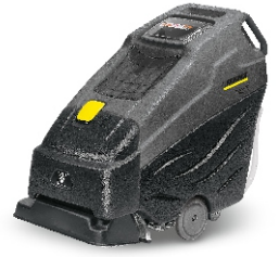
BRC 50/70 W BP