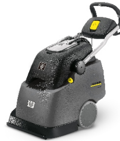
BRC 45/45 C Ep