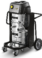
IVC 60/30 Ap