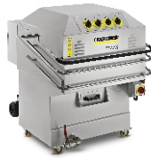
PC 60/130 T