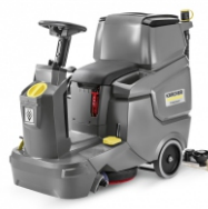
BD 50/70 Bp Classic