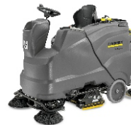
B 150 R Bp