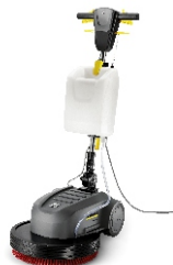
BDS 43/180 C IN