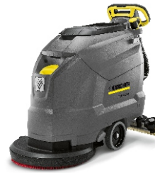
BD 50/60 Classic EP