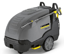
HDS 10/20-4M Eco