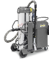
IVS 100/75 M