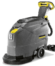
BD 43/40 Classic EP