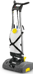
BRS 43/500 C