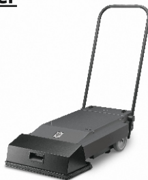
BR 45/10 Esc