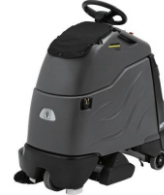
CV 60/2 RS