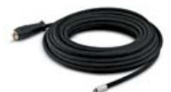
Drain Cleaning Hose