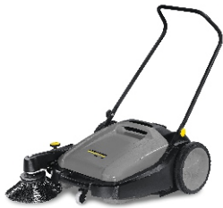
KM 70/15 C