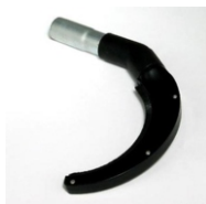
Pipe Cleaning Nozzle