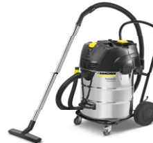
NT 75/2 Ap Me TC

Me : Stainless Steel Ap : Manual Pressed Filter Cleaning TC : Tilting Container TACT/TACT 2 : Automatic Filter Cleaning