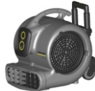
AB 45 Classic