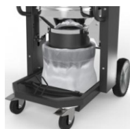
Longopac Disposal System