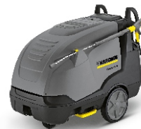
HDS 8/16 - 4 kW - 4 E (12/24/36 kW)