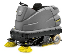
B 250 R Bp