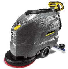
BD 50/50 Classic