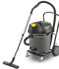
NT 65/2 Ap