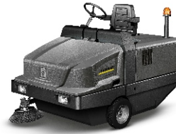
KM 130/300 Classic