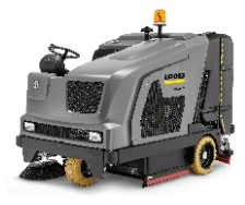
B 300 RI