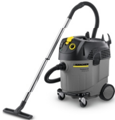
NT 35/1 Ap