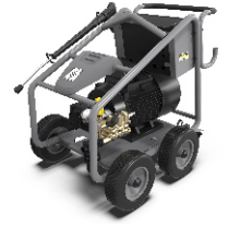
HD 13/50-4 Cage Classic